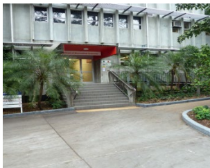
Senate Carpark – Skerman Bld