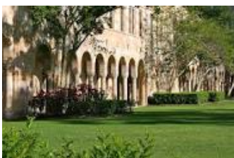
Great Court - Otto Hirschfeld Bld